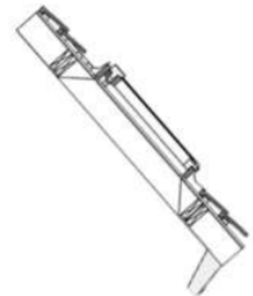
Section Scale 1:20