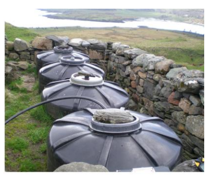
Various works can be eligible for the grant

You may be eligible for financial assistance if: