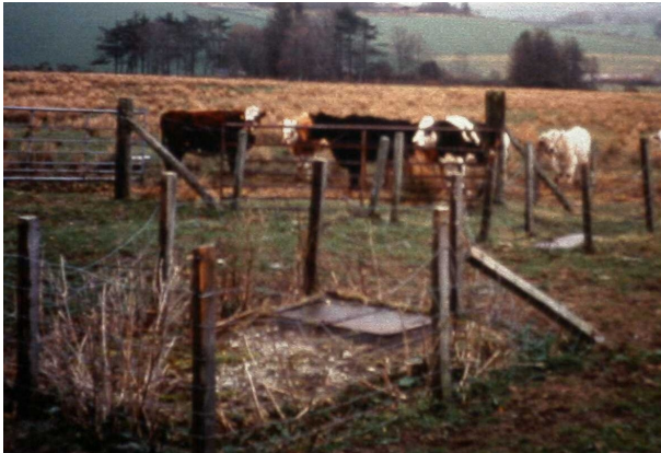
This is a typical storage facility for a private water supply. We can provide advice and assistance to make it safer.

If you are unable to access the internet then please contact your area office and they will post out an information pack that may assist you.