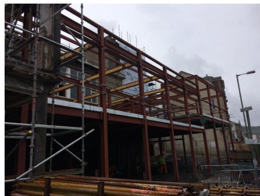
Zone 5 Overview