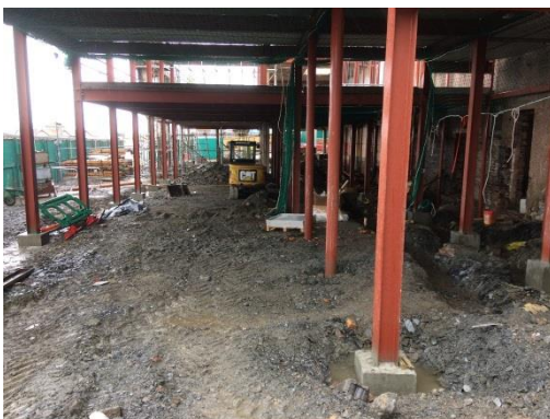
Zone 5 Groundworks