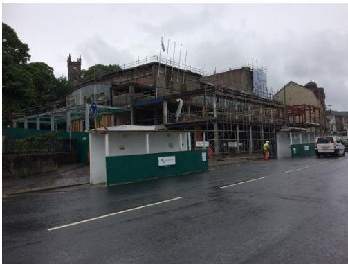
Southern and Western Elevations