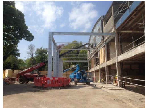
Zone 1 Canopy Steel