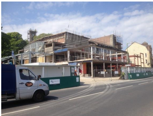
Southern and Eastern Elevations