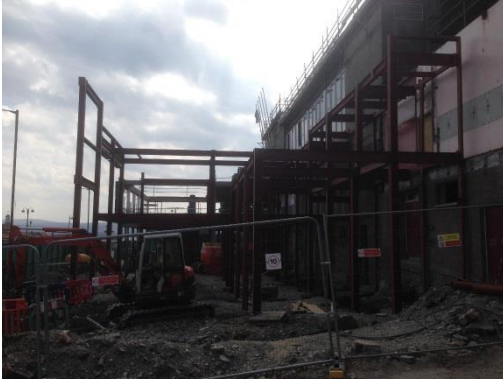
Zone 5 Steelwork