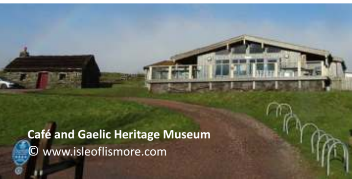
Café and Gaelic Heritage Museum