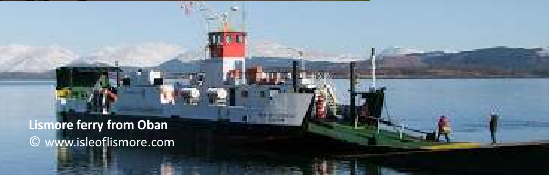
Lismore ferry from Oban