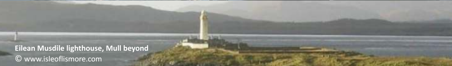
Eilean Musdile lighthouse, Mull beyond