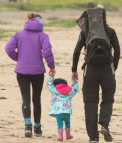
Machrihanish

The Gauldren's and Innean's bay, the nature reserve at Largiebaan and visit the bird observatory at Machrihanish