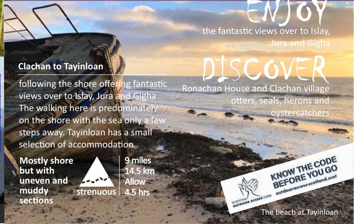
The beach at Tayinloan