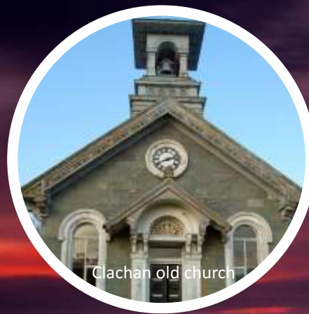
Clachan old church