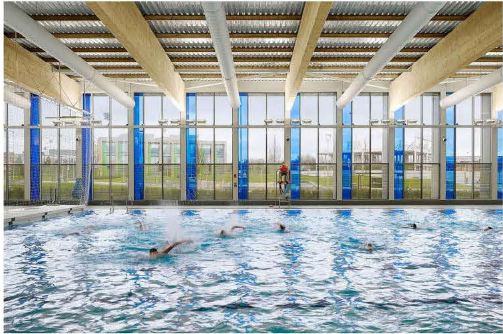
CONNECTION BETWEEN BEAMS & GLAZING