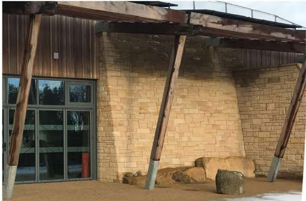
ANGLED BUTRESS WALL TO BASE OF BUILDING