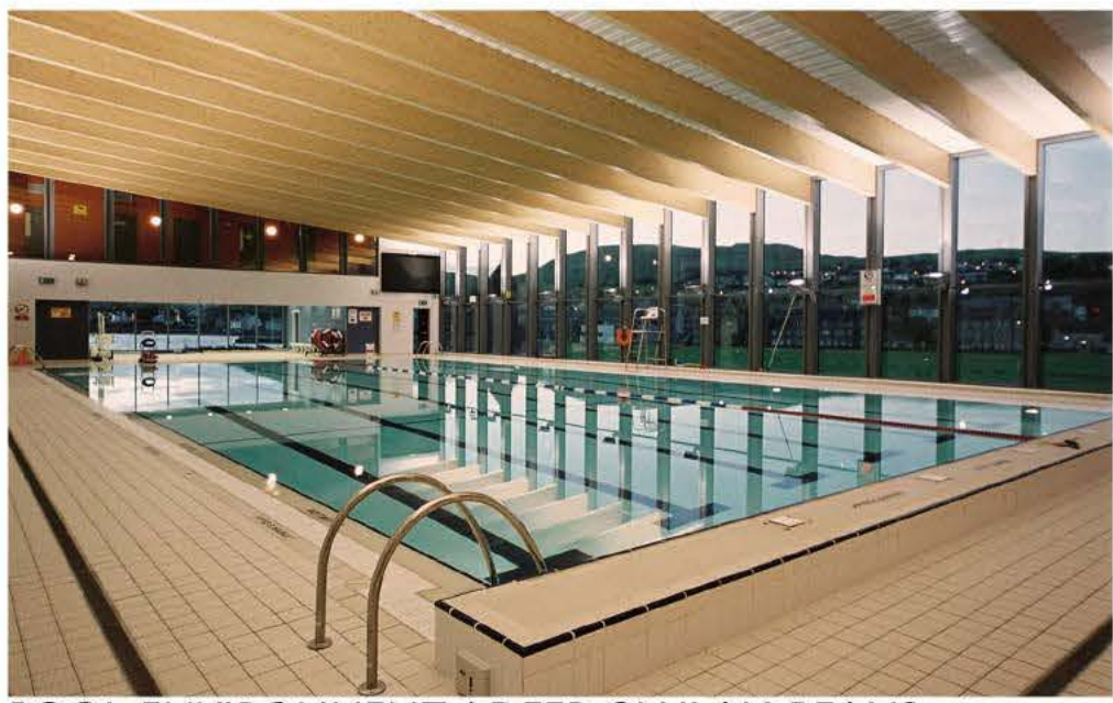
POOL ENVIRONMENT / DEEP GLULAM BEAMS