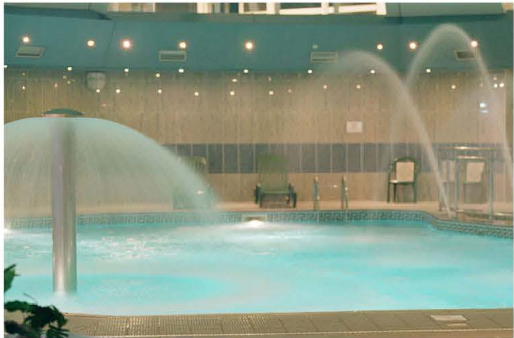
SPLASH POOL WATER FEATURES