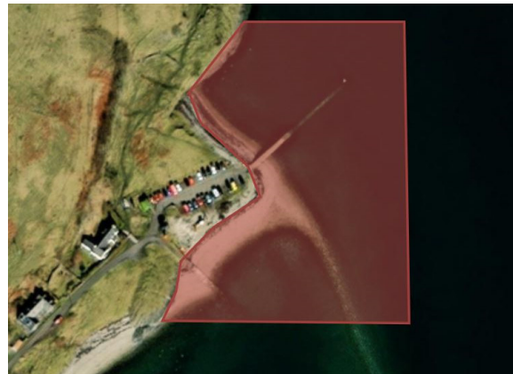
FIGURE 1 - SURVEY EXTENTS: LISMORE POINT, ARGYLL

The works are due to commence 16.10.2025 for a period of 1 to 2 days and comprise of fixed sensors being deployed from the survey vessel "Coastal Sensor". VHF radio watch on channels 12 & 16 will be monitored throughout the works.