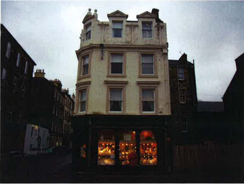
Elevation to Watergate.