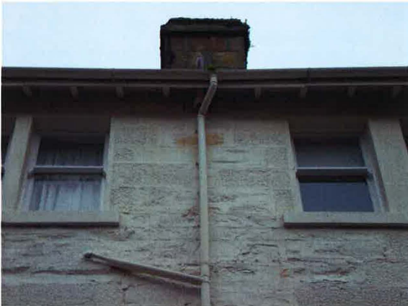
Existing window configuration. Note moulded horns.