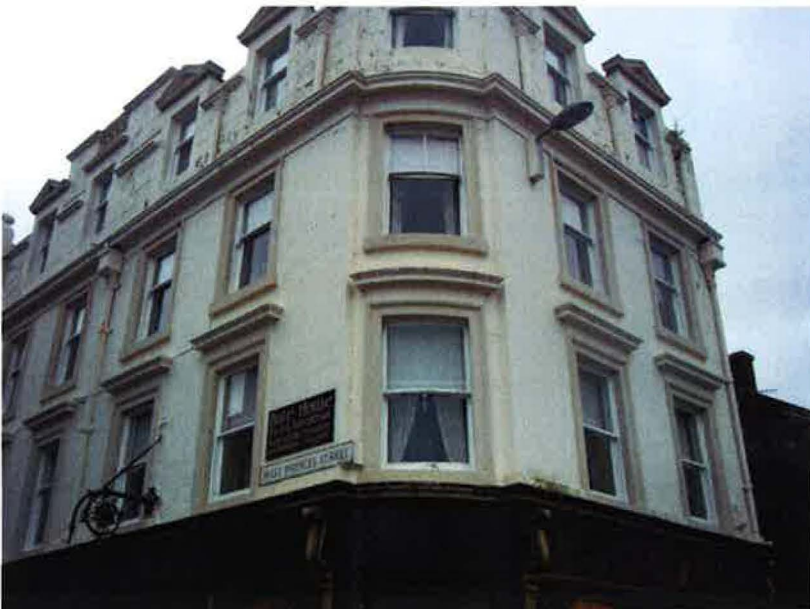
Curved glazing to corner of Watergate and West Princes Street.