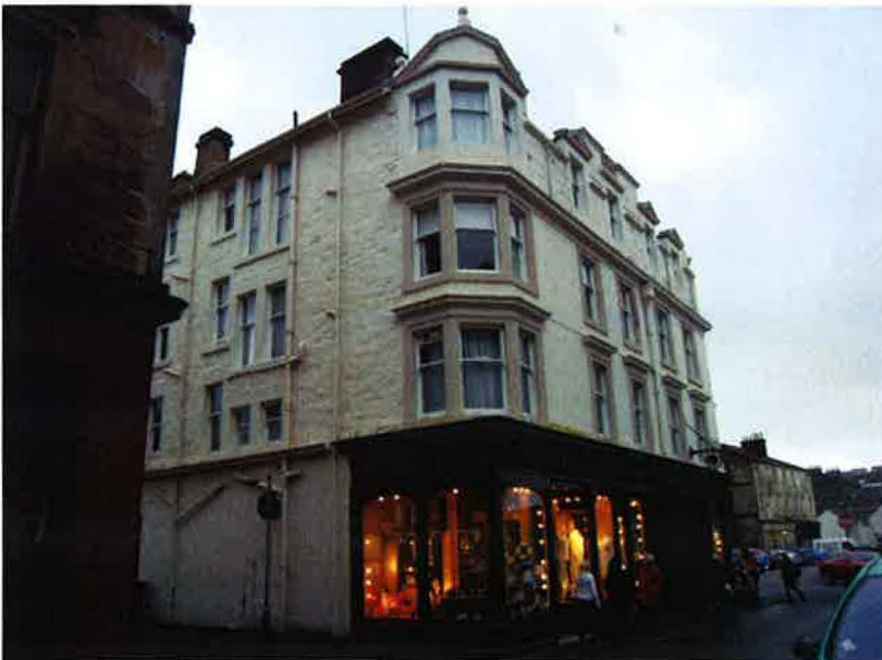
Elevation to West Princes Street / Store Lane.