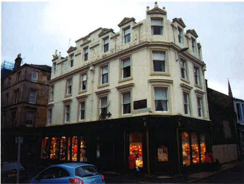
Elevation to West Princes Street. Note the astragal to the second floor corner curved window.