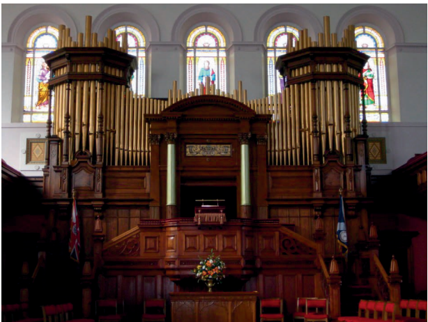
[35] the organ case in Longrow United Presbyterian Church, now Lorne and Lowland Church of Scotland

In Campbeltown he was responsible for several fine designs – [33] Campbeltown Cottage Hospital (1894), [34] the organ case in Longrow United Presbyterian Church (1895), [35] Creagdhù Mansions (1897), [36] the former Public Library and Museum (1897), a masterly work incorporating much fine detail and [37] Rothmar (1897 and its extension (1937)).