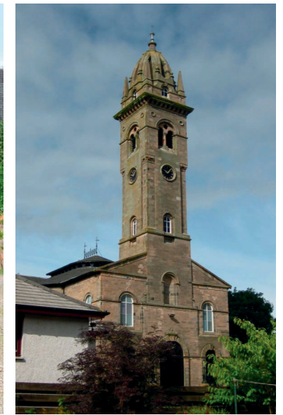
[5] Lorne and Lowland Church, Longrow 1869 J Burnet Italianate tower and crown spire financed by the distiller, John Ross Ornamental lamps gifted by the Dunlop family 5 windows at the rear were the first stained glass ones in Campbeltown 3 rounded entrance doors with pilasters and keystone feature Round arched windows throughout