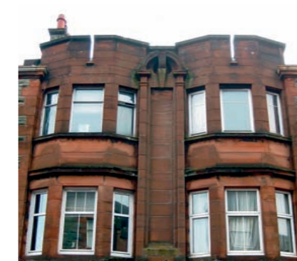
[7] Barochan Place, Argyll Street 1907 T L Watson Erected as a speculative housing venture by the architect. Watson's buildings were all designed "with conviction and impeccable taste" Bull faced stonework with sandstone dressings Corbelled bay windows Recessed columns Keystone feature projecting through open bottomed semi-circular pediments.