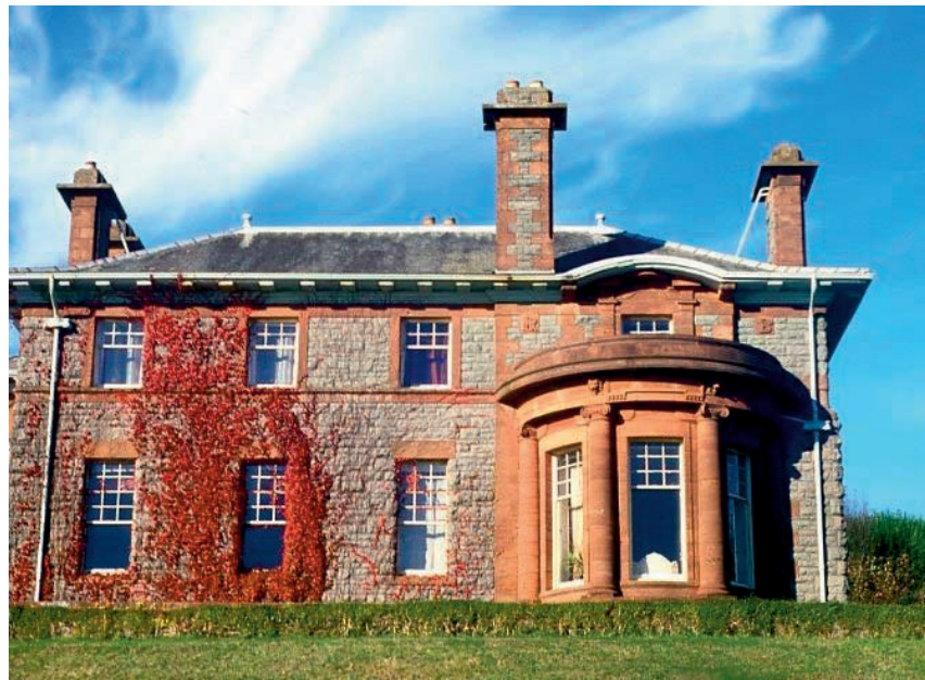
[37] Rothmar, High Askomil (Grade A listed building) 1897 J J Burnet extended 1937 2 storey, asymmetrical 4 bay American-style villa. Bull faced stonework with polished red sandstone dressings at windows. Attractive semicircular bow window with engaged Ionic columns. Built for William Broom, shipbuilder.