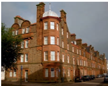
[7] Barochan Place, Argyll Street

Other works of note by Watson are the heavily detailed Evening Citizen Building (1877) in St Vincent Place, Glasgow and, nearer to hand, the Royal Clyde Yacht Club and Hotel (1888) at Hunter's Quay. Watson also designed the interiors of several steam yachts during the 1890s.