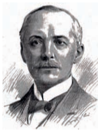
John James Burnet