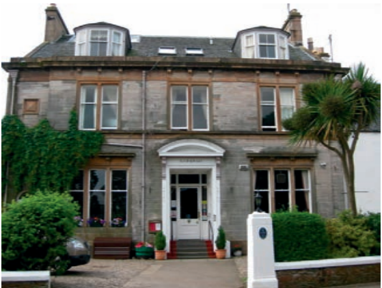
[6] Hazelbank House (Ardshiel Hotel)