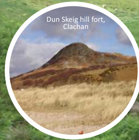
Dun Skeig hill fort, Clachan