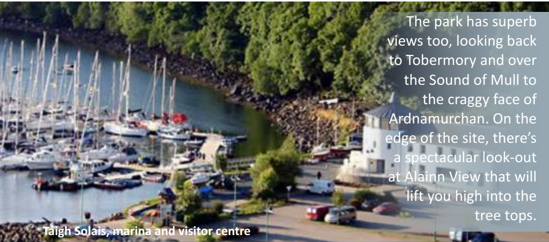
Taigh Solais, marina and visitor centre

Aros Park Aros Park is like a fabulous back garden for the town of Tobermory. Trails wander through attractive woodland, lush with ferns, and there's a waterfall to discover, plus a play trail for children to explore. There are picnic tables and public toilets beside the loch.