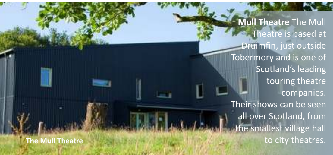
The Mull Theatre

The park has superb views too, looking back to Tobermory and over the Sound of Mull to the craggy face of Ardnamurchan. On the edge of the site, there's a spectacular look-out at Alainn View that will lift you high into the tree tops.