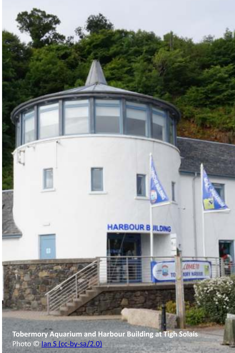
Tobermory Aquarium and Harbour Building at Tigh Solais