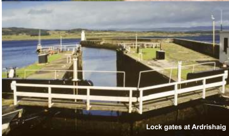
Lock gates at Ardrishaig