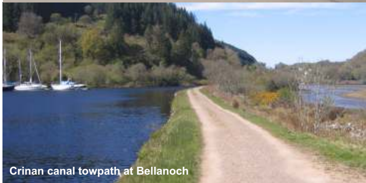
Crinan canal towpath at Bellanoch