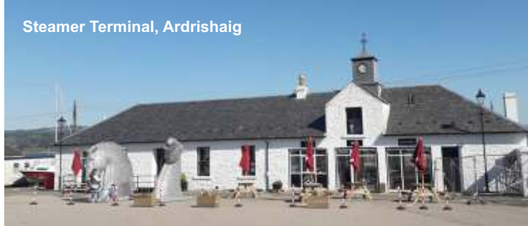
Steamer Terminal, Ardrishaig

Need to inflate your tyres or tighten something up try the "Wee Repair Station" outside the Egg Shed Heritage and Community Hub where you can learn the story of the Crinan Canal.