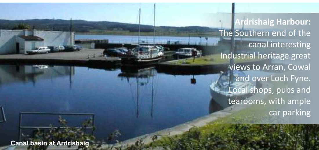
Canal basin at Ardrishaig

Cairnbaan: Located at the canal halfway point the village of Cairnbaan has examples of Iron Age 'cup and ring' marks, and a Bronze Age burial monument, or cairn. At the Cairnbaan Hotel you can refuel and watch the world – and one or two boats – pass by.