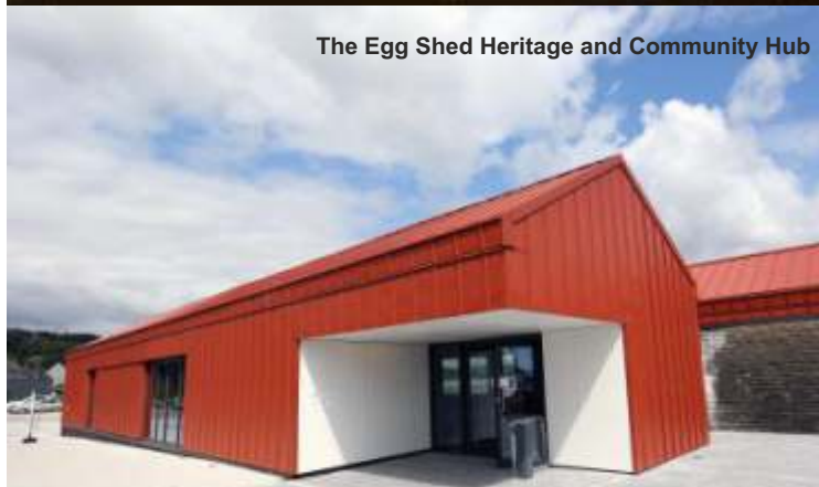
The Egg Shed Heritage and Community Hub