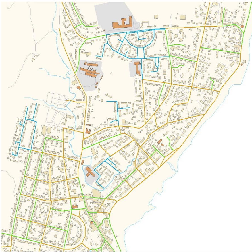
Helensburgh town centre