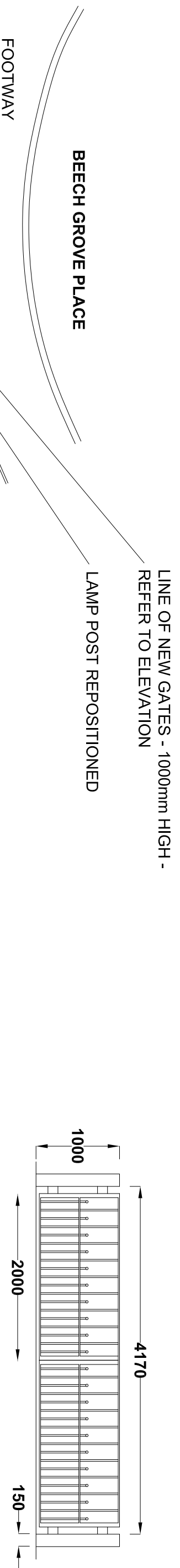
gate elevation as proposed scale 1:50 @ A3