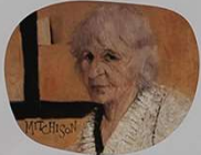
Naomi (Lady) Mitchison, 1897 - 1999. Author Painted by Clifton Pugh