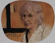
Naomi (Lady) Mitchison, 1897 - 1999. Author Painted by Clifton Pugh