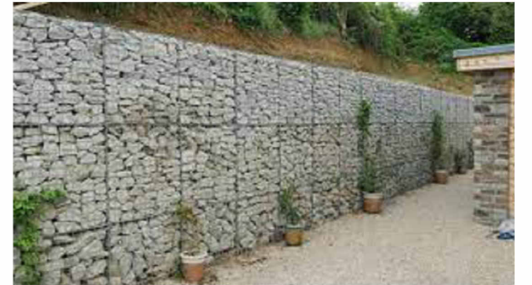
Gabion Basket Retention

Plot Area = 1230m2 House Footprint = 112m2 Amenity Space = 1128m2