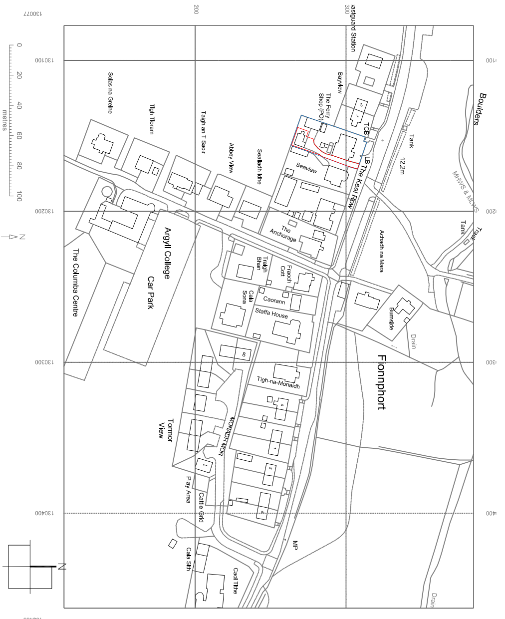
LOCATION PLAN SCALE 1:2500

OWNERSHIP BOUNDARY APPLICATION BOUNDARY BLOCK PLAN SCALE 1:200