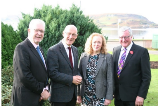
With Michael Russell, John Swinney and Fergus Ewing at COHI

I have been in contact with all of the Ministers following COHI to build on our formal and informal discussions and to invite them back to Argyll and Bute in the future to explore any areas of interests and ways we can work together.