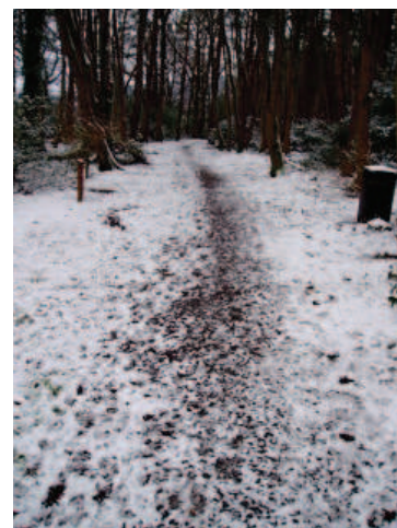
Footprints in Duchess Wood

“ The snow test ”. Visitor numbers have not been measured recently. FODW has discussed this issue. The only indication has been periodic use of the “snow test”. This is a rough indicator, but interesting. It simply consists of going to four key sites mid-morning and assessing footprints after an overnight fall of snow. The results have always been the same. : • Seafront Promenade and Duchess Wood : heavily used. • Hermitage Park : used a bit, but not much. • Walker’s Rest : no footprints at all – except from birds ! All the evidence suggests that Duchess Wood is much valued.