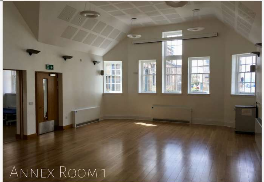
ANNEX ROOM 1

We have a small bridal area equipped with a lit-up dressing table that can be used for getting ready and for storage.