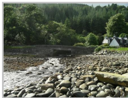
The Abhain Strathain Burn flowing onto the shore at Sloc nam Fearn

Harbour porpoise and common seals are seen regularly in this area. Surveys of benthic communities in this policy zone are limited, but at the transition of this policy zone to policy zone D, Marine Nature Conservation Review surveys indicate sheltered steep or narrow, intertidal rock, and mixed substrata with dense seaweed including bladder wrack, toothed wrack, spiral wrack and kelp. In deeper water, the seabed is composed of sheltered sublittoral mixed sediments with sparse horse mussels and the tube anemone Cerianthus lloydii . The River Artilligan supports migratory salmonid populations and is part of the loch-wide wild fish restoration project.