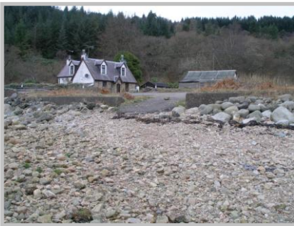
Shore access from lay-by at Sloc nam Fearna

The main A83 trunk road runs parallel to the loch shore from Aird nan Ròn to Strondoir Bay. There is only one point of access to the loch, at the Sloc nam Fearna lay-by, where it is possible to launch small boats from trailers. This access to the loch lies adjacent to an old concrete jetty which is in a state of ruin.