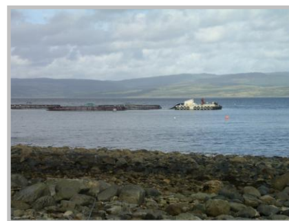
Meall Mhor salmon farm site at Sloc nam Fearnna showing feed barge

Lighthouse Caledonia Ltd. has a large salmon farm site at Meall Mhor. Fish farm boats regularly sail back and forth between Meall Mhor and Strondoir Bay, where there is a shore-base facility.