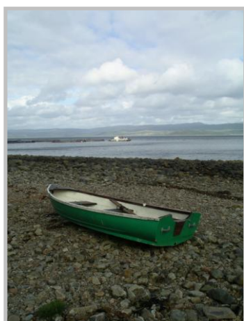
Small angling boat left on shore at Sloc nam Fearnna