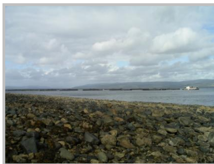
Meall Mhor salmon farm site at Sloc nam Fearna