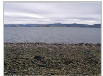
General view across Loch Fyne to the low rolling hills of Cowal