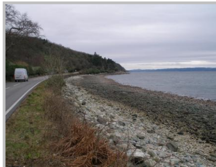
A83 trunk road going north and running parallel to Loch Fyne shore