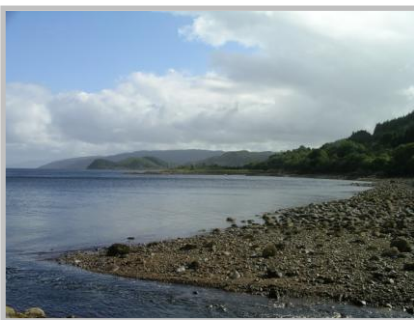
View south from Sloc nam Fearna towards Barmore Island and Stonefield Castle

From the trunk road, which is very close to the loch shore, views are broad, open, distant, mostly uninterrupted and generally unremarkable over to the rolling hills of Cowal, which are dominated by forestry plantation. There are no paths adjacent to this area, but there are a few lay-bys along the road side with open views to the loch. At Clach an Easbuig, there is a view point with a roadside picnic table. Views at Sloc nam Fearna are dominated by the Meall Mhor salmon farm, which lies particularly close to shore.