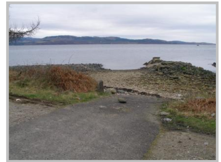
Shore access at Sloc nam Fearna with remains of old jetty to the right