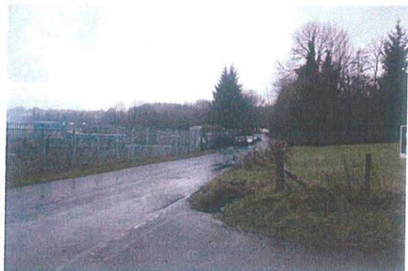
Junction between NP018 and the B833 road. NP 017 can be seen as the road verge next to the metal fence of boat yard.