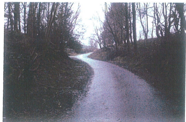
Looking along NP018 towards Clachan Farm