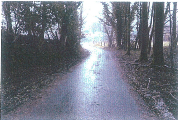
Looking along NP018 toward the B833 and Boat yard