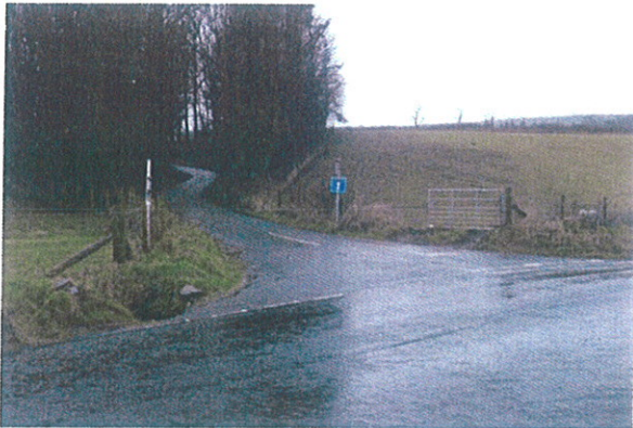
Junction between NP018 and the B833 Road