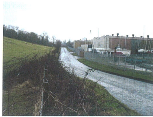
8. Verge at boatyard-North