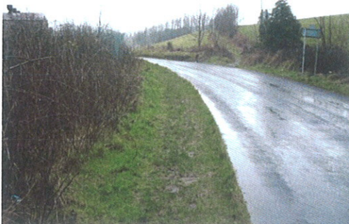
9. Verge North of boatyard