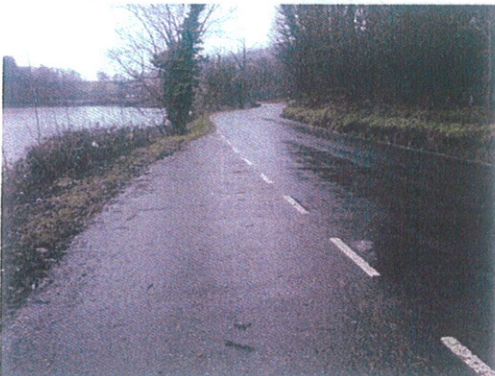
3. Narrow verges looking south from lay-by