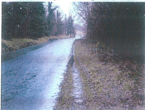
5. Narrow verge towards Roseneath