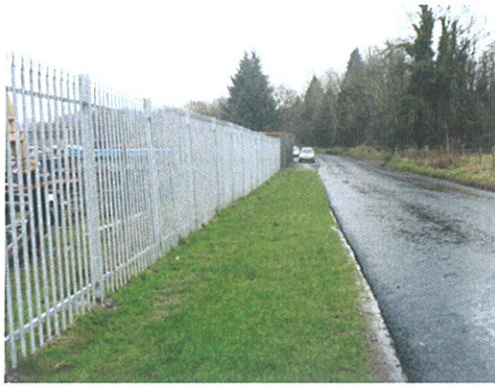
7. Verge at boatyard-South