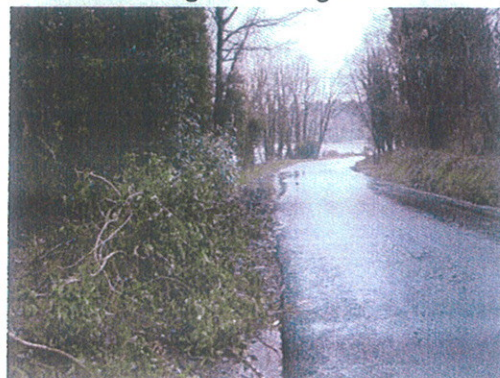
6. Verge blocked looking South