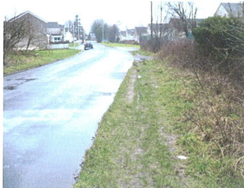
10. End of NP017 at Roseneath.