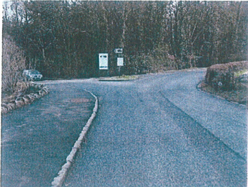
1. Looking south towards caravan park at the southern end of the path

Photographs of the path and surroundings with comments