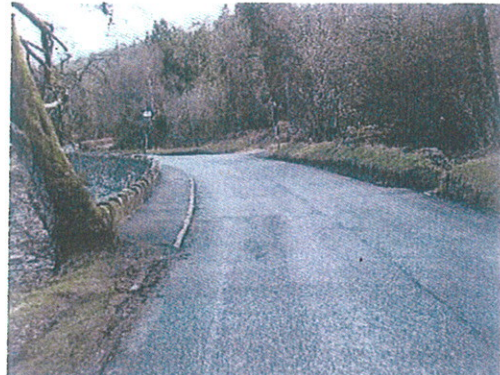
2. End of footway, north of caravan park entrance