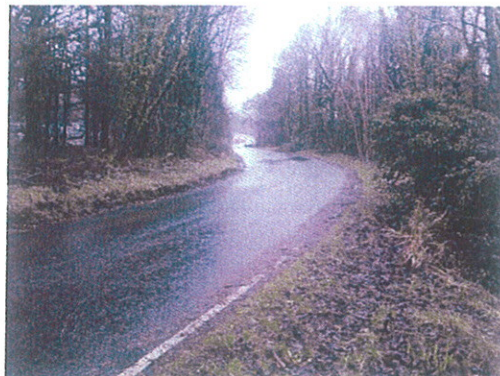
4. Narrow verges looking north from lay-by