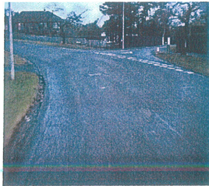
2. Golfhill Drive junction