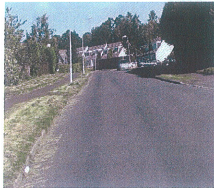
4. North Abercromby Cr