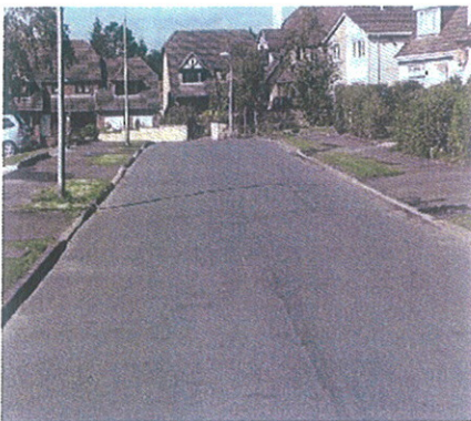
3. West along Abercromby Cr