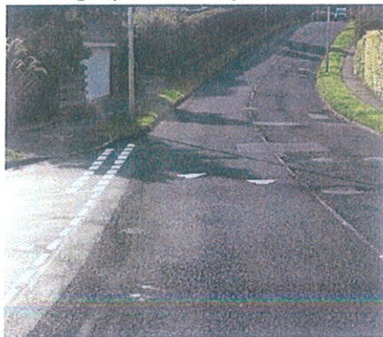
1. East Lennox Drive junction

Photographs of the path and surroundings with comments