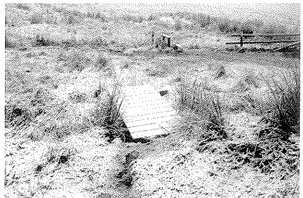
The route joins the Three Lochs Way C275 just beyond the bridge in the foreground