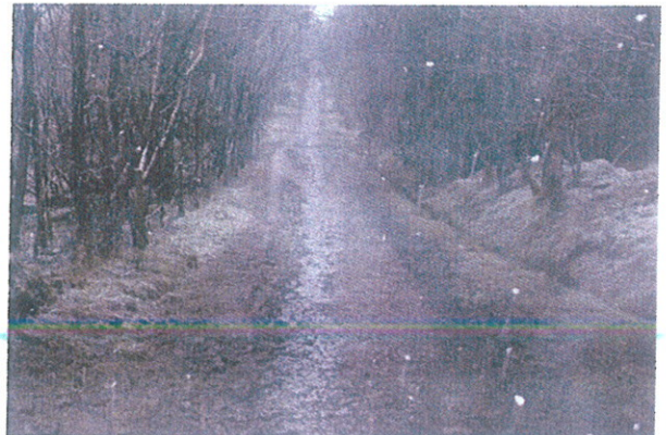
Looking west along C278 from location of sign