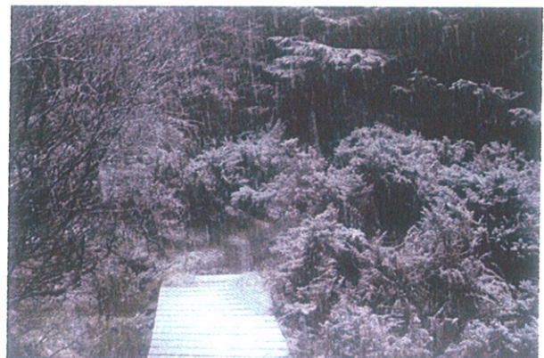
Path is overgrown in places