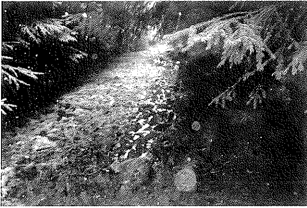
Sections of the path are very wet and muddy