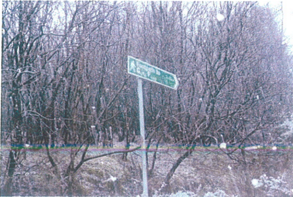
Old Right of Way sign, located approximately where the route joins 278 and 273(b) at its western end