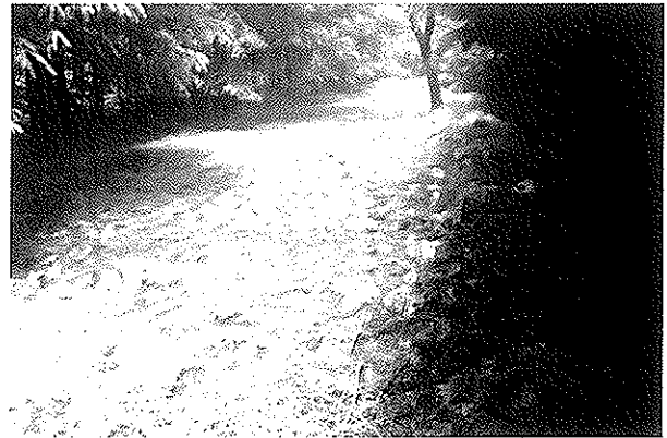
Another wet and muddy section of the path