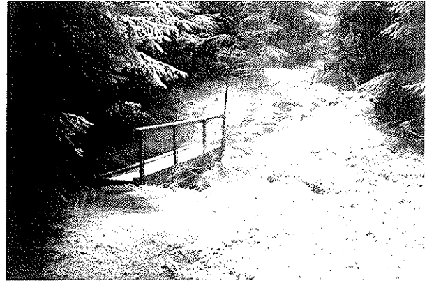
Another bridge along the path