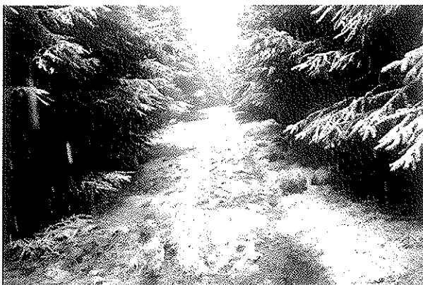
A further wet and muddy section which make up A large proportion of the route