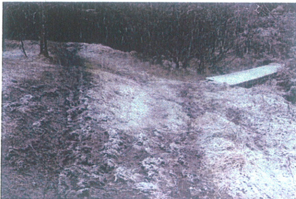
The route has some path infrastructure on it, such as this wooden bridge