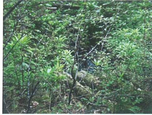
Another picture of the old bridge, it was not possible to get better photographs due to vegetation