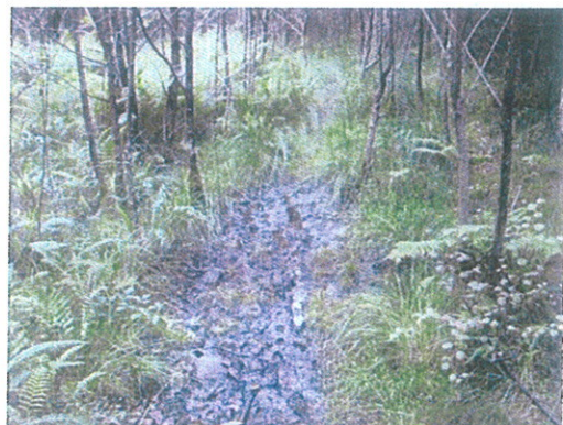
However many sections that are wet and muddy