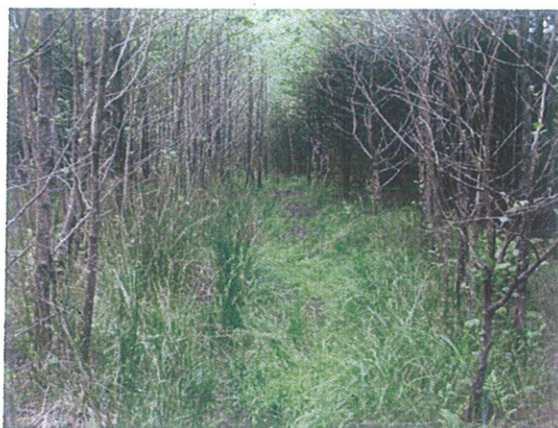
The track improves about 200m from layby