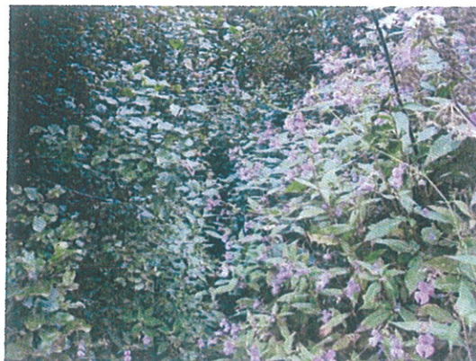
Continuing along C486 from the B833 layby- path very overgrown with vegetation.