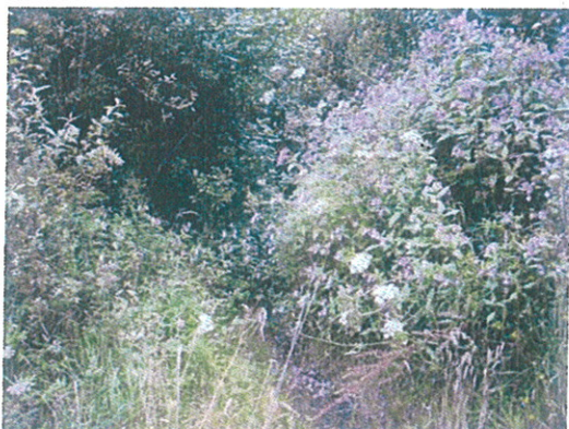
B833 layby looking south west towards C468- overgrown with Himalayan Balsam

Access Officer visited the site on 2 nd August 2011