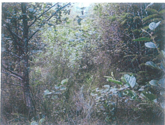
Path wet, muddy and overgrown in many areas