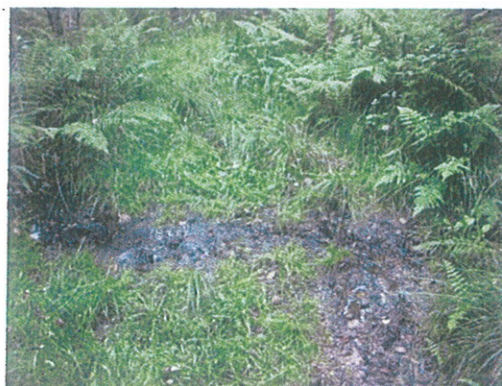
A small stream/ditch crossing path