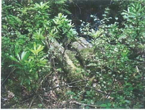
Old bridge that is overgrown and appears to be in a poor condition however it is not known if it is structurally sound