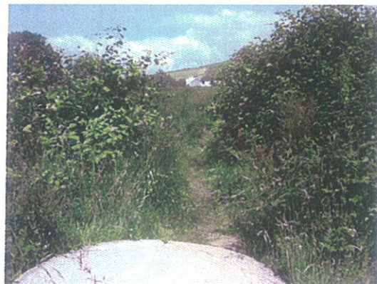
Looking towards Craigrownie Gardens from outside Play Park