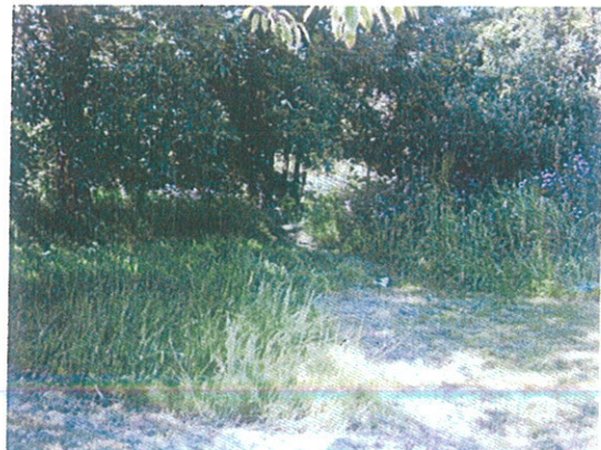
From Craigrownie gardens looking southwest towards path that passes through the woodland