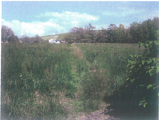
Section of trod path in field looking towards bowling green and Play Park